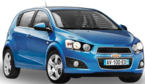
AVEO T300 2011-2016