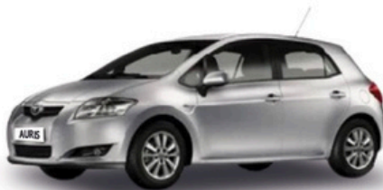
AURIS Année 2007-2010