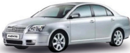
AVENSIS Année 2003-2008