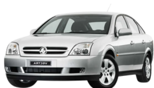
VECTRA REGULAR 2003-2008