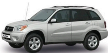
RAV 4 Année 2003-2005

Your safety is our top-ranked priority STOP DRIVE & FREE REPAIRS