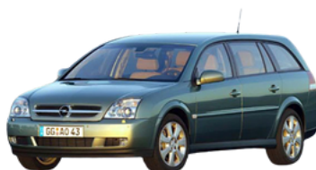
VECTRA STATION WAGON 2003-2008