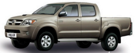
HILUX Année 2005-2011