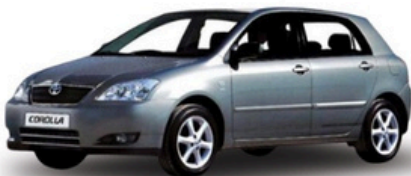
COROLLA Année 2004-2013