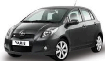
YARIS Année 2005-2011