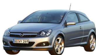
ASTRA et GTC 2005-2018