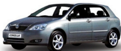
COROLLA Année 2004-2013