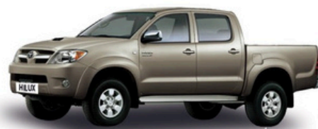
HILUX Année 2005-2011