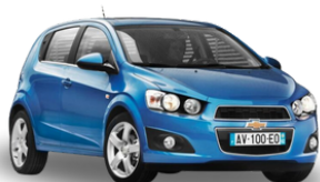
AVEO T300 2011-2016