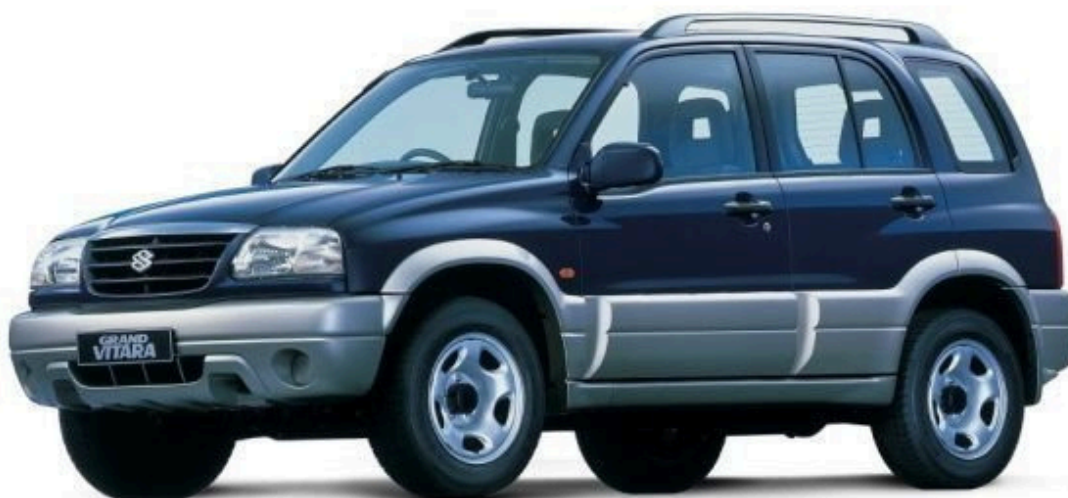
Grand Vitara Années 1998-1999