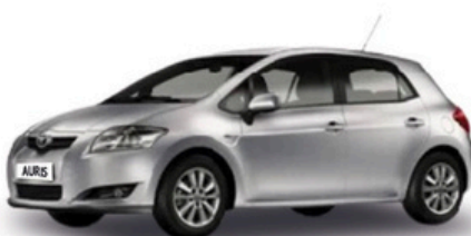
AURIS Année 2007-2010