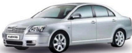
AVENSIS Année 2003-2008