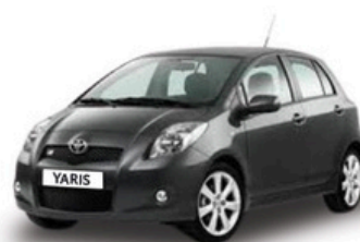
YARIS Année 2005-2011