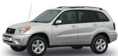
RAV 4 Année 2003-2005