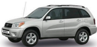
RAV 4 Année 2003-2005