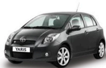
YARIS Année 2005-2011