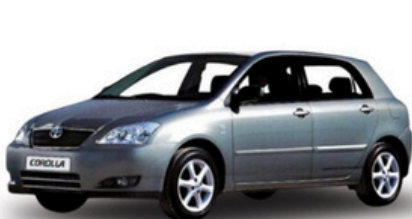
COROLLA Année 2004-2013