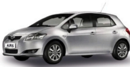
AURIS Année 2007-2010