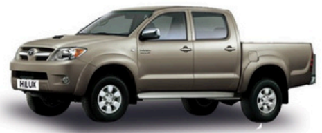
HILUX Année 2005-2011