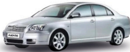
AVENSIS Année 2003-2008