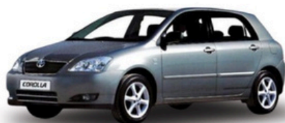
COROLLA Année 2004-2013