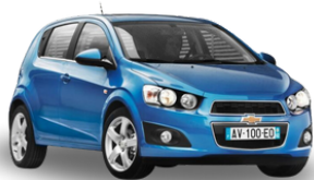
AVEO T300 2011-2016

YOUR SAFETY IS OUR TOP PRIORITY TRAFFIC STOPPAGE & FREE REPAIR