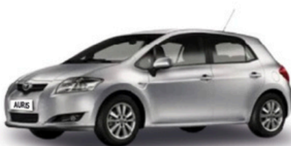
AURIS Année 2007-2010