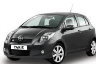
YARIS Année 2005-2011