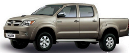
HILUX Année 2005-2011