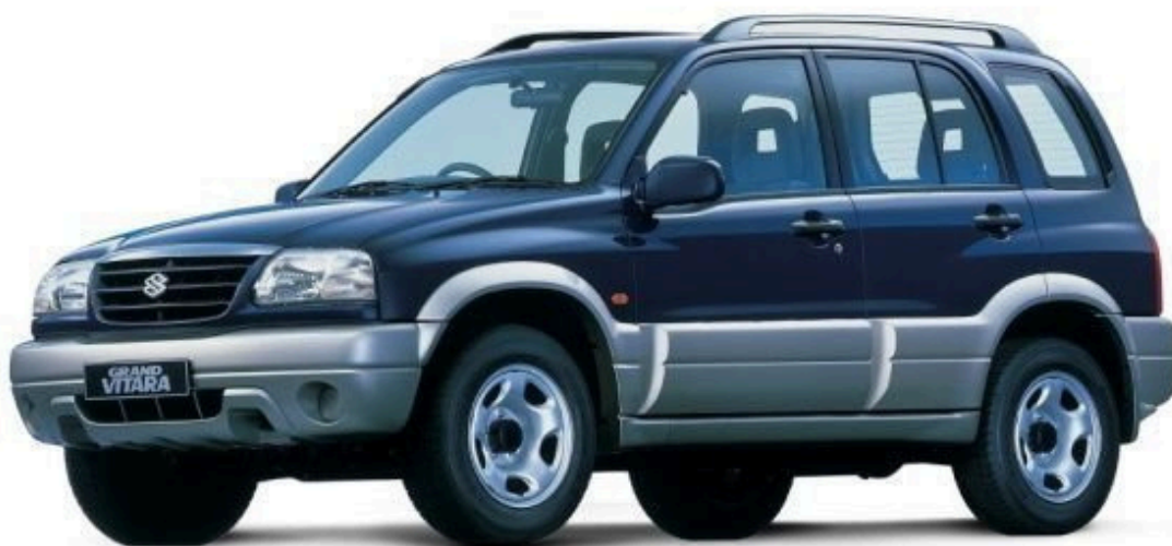
Grand Vitara Années 1998-1999

YOUR SAFETY IS OUR TOP PRIORITY FREE REPAIRS