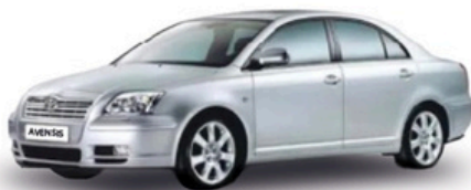
AVENSIS Année 2003-2008