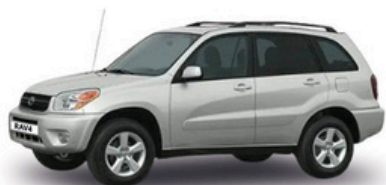
RAV 4 Année 2003-2005